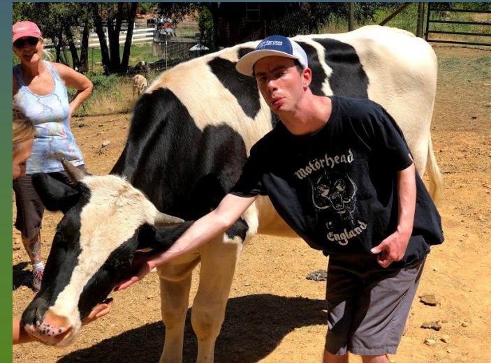
Visiting our animal friends at Blackberry Creek Animal Sanctuary