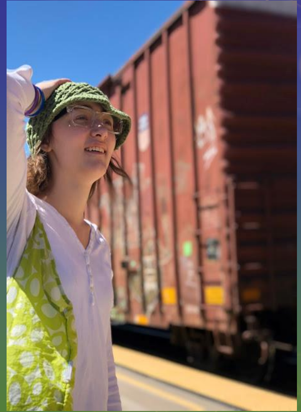
Catching the Train from Colfax to Truckee