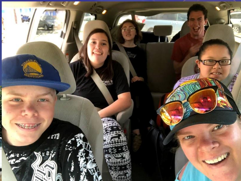
Camping at Sugar Pine State Park