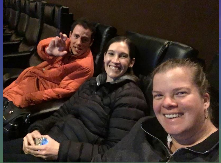
Catching a movie and pizza with our friends from Choices