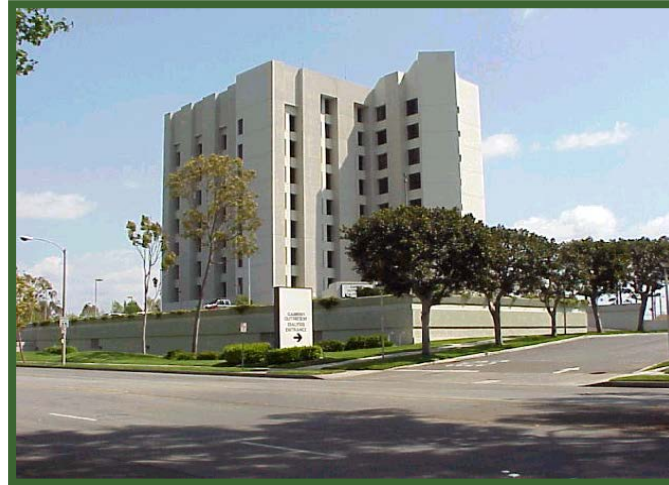
Anaheim Campus NOCCCD Offices