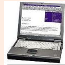
Freedom 2000 Toughbook