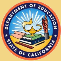
TOM TORLAKSON State Superintendent of Public Instruction